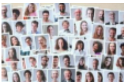
On Site Interpreting