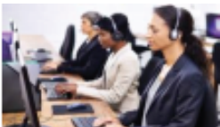
Video-Zoom Translation Service