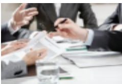
Insurance Translation Service