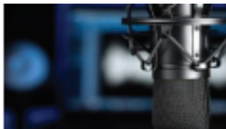
Multilingual Voice Over Service