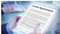
Finance Translation Services