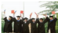
Academic Equivalence Evaluation