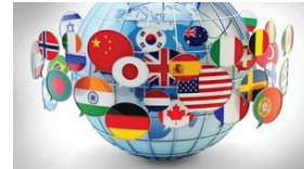
International Global Promotion