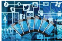
Social Media Instruments