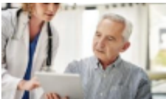
Video-Zoom Remote Interpretation