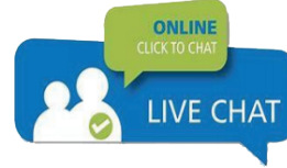
Business chat system