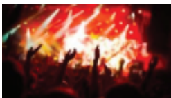
Audio Translation Services