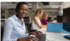
OPI Telephonic Interpreting