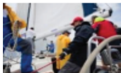
Manufacturing Technical Translation Service